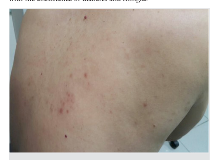
Figure 1: Rash, crusted lesions in the right T5-T8 dermatoma

In the neurological examination, no abnormality was detected, except for hypoactivity of deep tendon reflexes in all foci and outward vision restriction in the right eye (Figures 2 and 3). There was no abnormal value except HbA1c 8.0% in routine blood tests. The results of contrast-enhanced cranial magnetic resonance (MR) (fine section of the brain stem), Cranial Venous / Arterial MR Angiography, and Computerized Tomography (CT) Angiography for Cervical and Cranial Arteries were normal (Figure 4). Cerebrospinal examination could not be performed because patient's consent could not be obtained for lumbar puncture examination. In the ophthalmological examination performed by an ophthalmologist, there were no features except isolated 6th cranial nerve paralysis on the right. Acyclovir 5x800 mg / day treatment was completed in 7 days. At the 8th week follow-up after the treatment, while skin lesions of the patient partially continued, the outward gaze restriction was completely resolved. After ruling out other reasons, it was thought that the 6th cranial nerve injury might be cranial neuropathy associated with the coexistence of diabetes and shingles