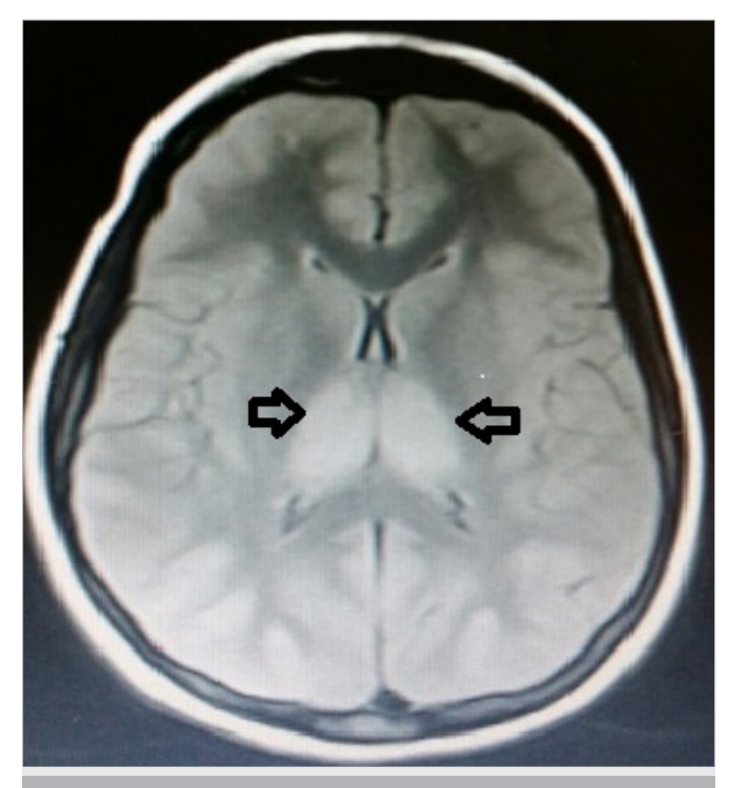
Figure 1. Signal increase in bilateral thalamic region in flair sequence is present during initial magnetic resonance imaging

Echocardiography revealed 65% ejection fraction and no mass or structure indicating endocarditis in the valves was detected.