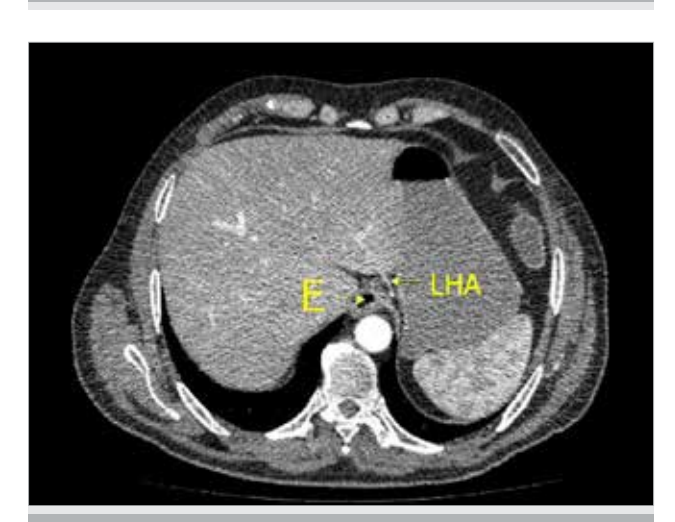
Figure 2. The left hepatic artery (LHA) branched from the splenic artery (SA)