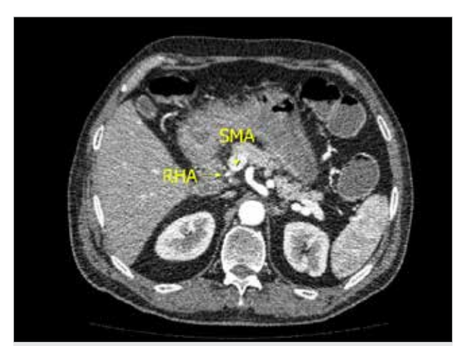
Figure 1. The right hepatic artery (RHA) branched from the superior mesenteric artery (SMA)

Because the present case was studied retrospectively, no signed informed consent was taken from the patient.