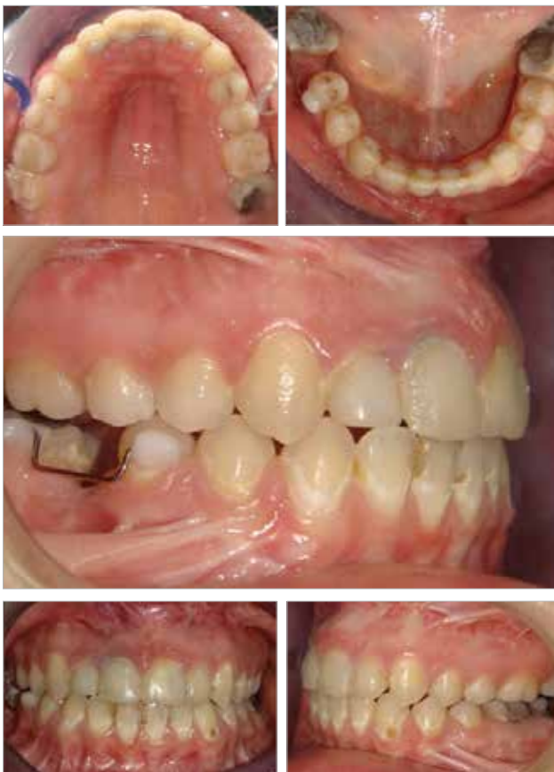
Figure 5. Bone removal from the hypertrophic side of the mandible

have been limited, and the asymmetry would not have been corrected. Further, considering her age and the health status of her teeth and to be able to establish an ideal emergence profile, the esthetic restoration of the anterior teeth was postponed to the end of the orthodontic and surgical interventions. After the oral maintenance and hygiene instructions, the patient was referred to the orthodontics clinic. The ortho-