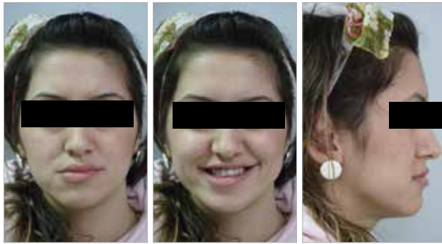
Figure 1. Initial extraoral images