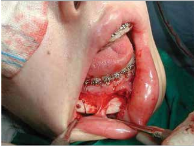
Figure 4. Intraoral images after the orthodontic treatment