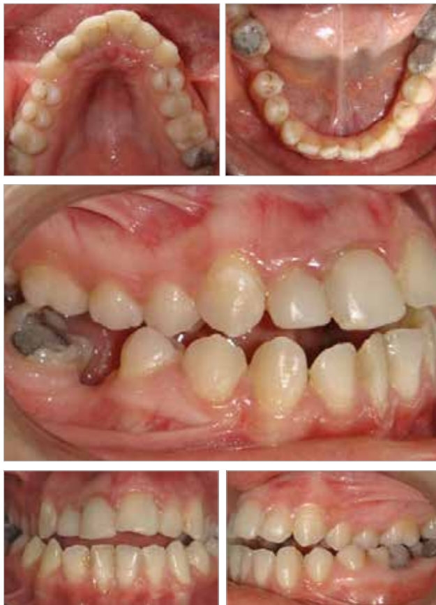
Figure 2. Initial intraoral images

sclera exposure at rest. The chin was deviated to the right, and the corpus had an asymmetrical shape. She also showed soft tissue asymmetry during smiling because of the right depressor labii inferioris muscle being less active than the left (Figure 1). She had lower anterior crowding, anterior open bite, and posterior cross-bite. Esthetically unsatisfactory old resin restorations were present on her upper anterior teeth (Figure 2). The upper and lower dental midlines were both shifted 1.5 mm to the right.