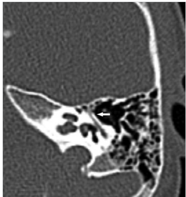
Figure 4. The normal left side

Penetrating trauma through the external auditory canal is extremely rare. The complications of the penetrating traumas from the external auditory canal are tympanic membrane perforation, hearing loss and tinnitus, vertigo, otorrhea, ossicular chain damage, cholesteatoma development in late period, perilymph fistula, and peripheral facial paralysis. Because of each three ossicular chain, oval window, and localization of the facial nerve, there are more risks that the tympanic membrane may be exposed to penetrating trauma from the posterosuperior quadrant.