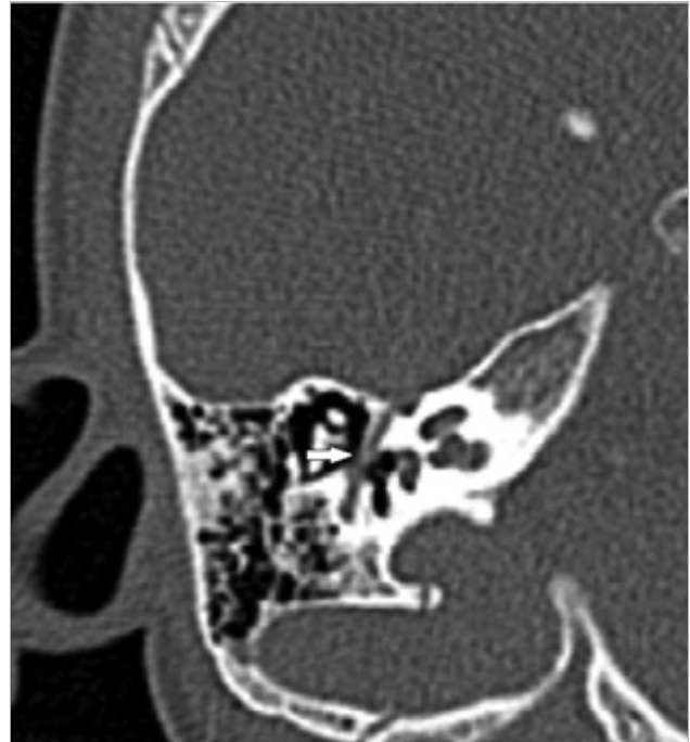
Figure 3. Facial dehiscence at the right ear tympanic segment

Firearm injuries are the most common among penetrating injuries. Firearm injuries are serious injuries, often caused by dural rupture, cerebrospinal fluid (CSF) rhinorrhea, damage in the otic capsule, and vascular damages.