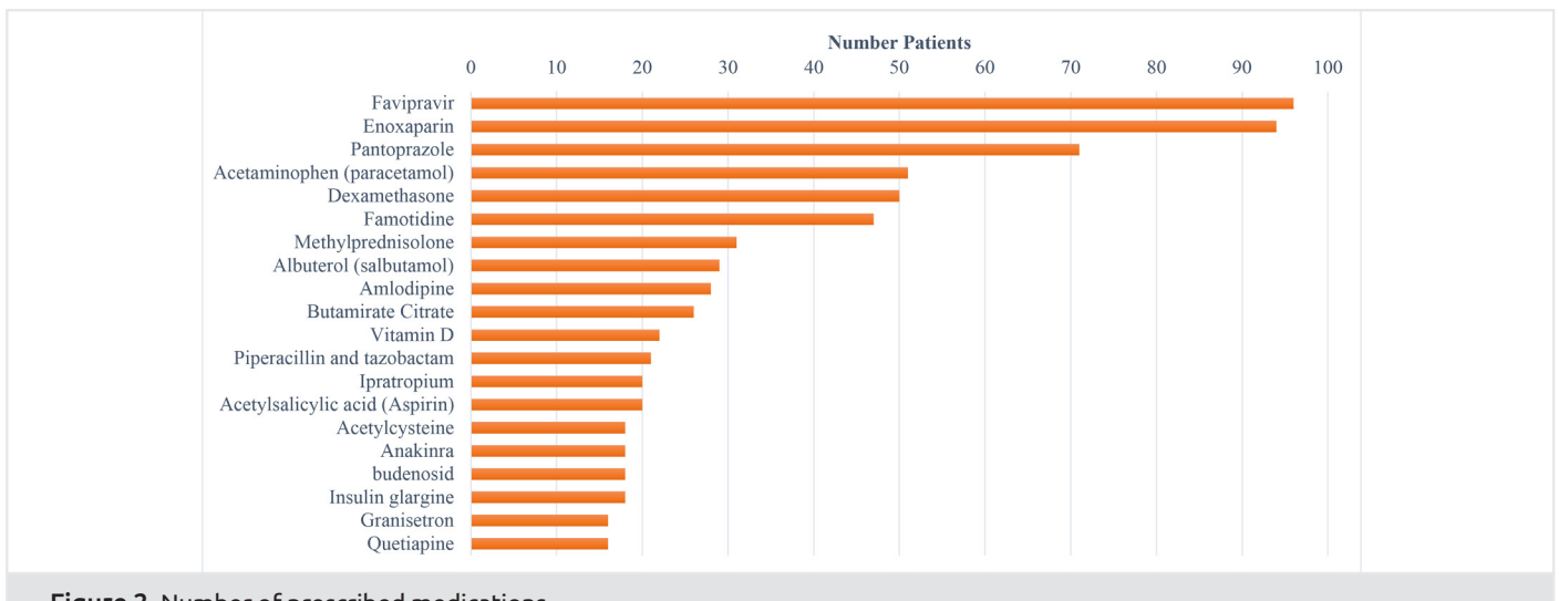
Figure 2. Number of prescribed medications

Medical conditions of the participants are summarized in Table 1. Among 107 patients, nearly half of them were diagnosed with hypertension (HT) (n=54, 50.47%). The second and the third most common comorbidities were Diabetes Mellitus (DM) (n=30, 28.47%) and coronary artery diseases (CAD) (n=25, 23,365), respectively (Table 1). Among 75 patients with detected DRP, 44 patients had HT, 25 patients had DM and 24 patients had CAD (Table 1).