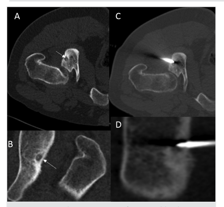
Figure 2A-D. In the examinations of 33-year-old male patient who was admitted with right hip pain, a lesion compatible with an osteoid osteoma with a 7 mm nidus located in the ischium in the posterior part of the acetabulum in axial (A) and coronal (B) CT sections (arrow). The patient was placed in the prone position and the lesion was entered with a CT-guided 11-gauge coaxial needle. Ablation procedure was performed with 17 gauge RFA probe in the coaxial system (C, D)

OO: Osteoid osteoma, CT: Computed tomography