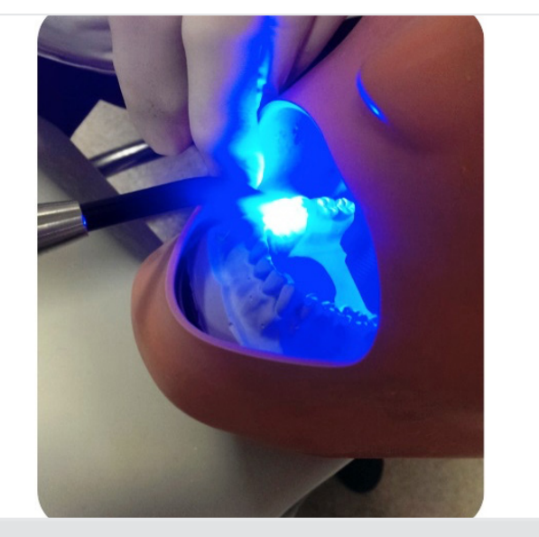
Figure 2. Restorations were performed on a dental phantom head to mimic the oral environment

Thereafter, all tooth surfaces (excluding 1 mm around the restoration margins) were sealed using two layers of nail polish to prevent dye penetration, and the apices were sealed with composite resin. The teeth were then immersed in 0.5% basic fuchsin dye solution for 24 hours, after which any surface adherent dye was rinsed off under tap water. The teeth were then sectioned longitudinally along the bucco-lingual plane through the center of the restoration using a water cooled, slow speed diamond blade (Esetron Smart Robotechnologies, Ankara/Turkey) to form two sections. The marginal sealing ability, as indicated by the depth of dye penetration around the enamel and dentinal margins, was evaluated under a stereomicroscope (SMZ1000, NIKON, JAPAN) at 40x magnification. The scoring scale used to assess extent of dye penetration at the tooth-