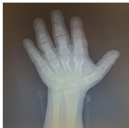
Figure 3. Hand and wrist radiograph with diagnosis of brachydactyly and bone dysplasia