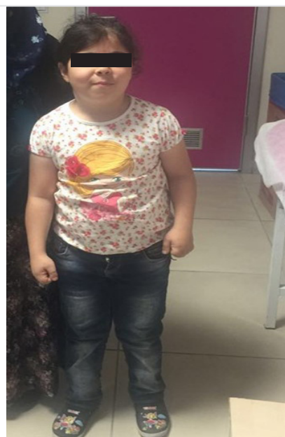
Figure 2. Short stature, round face, obesity

Pseudohypoparathyroidism Ia is the most prevalent PHP type. Along with typical phenotypic findings, cases showing heterogeneity have also been reported (12-14). Our patient had typical AHO phenotypes.